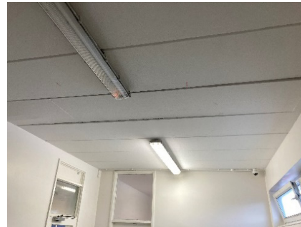
Figure 11: Example of deflected RAAC panel