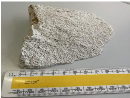
Figure 6: Aerated appearance of RAAC

RAAC panels are light grey or white in appearance, the underside of the panels will appear smooth. The inside of the planks will appear bubbly, often described as looking like an Aero bar. Unlike traditional concrete, there will not be visible stones (aggregate) in the panels