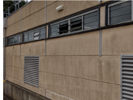
Figure 4: Example of RAAC in walls