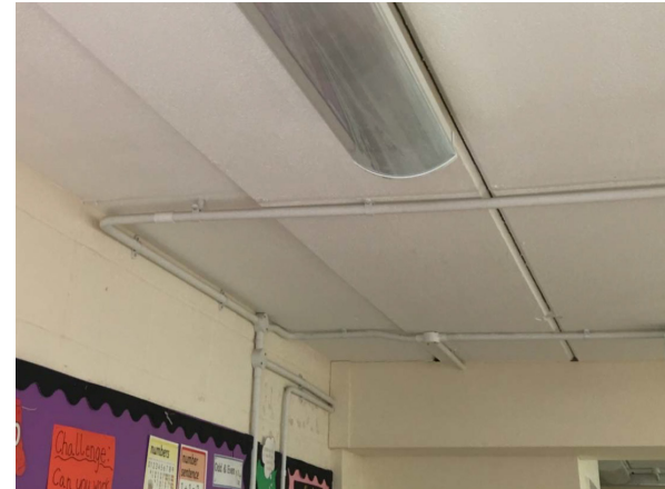
Figure 10: Example of deflected RAAC panel

RAAC panels may bow or deflect. From the underside of the roof or floor you may see a 'gap' between two adjacent panels.