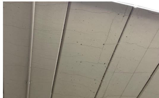
Figure 7: Underside of a cracked RAAC panel