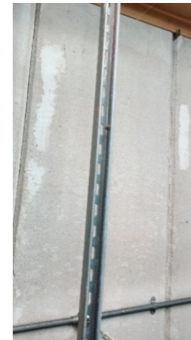
Figure 9: V-shaped grooves at 600mm spacing