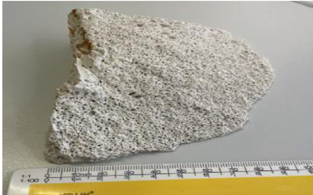
Figure 2: A fragment of RAAC showing its 'bubbly' appearance