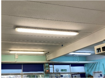
Figure 3: Example of RAAC in flat roofs/floors

RAAC panels are most commonly found on flat roofs, they may also be found in pitched roofs, floors or walls.